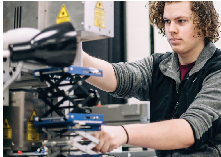
Printers used in CLC's laser/photonics/optics program are examples of in-kind donations.

Visit www.clcillinois.edu/give for more details.